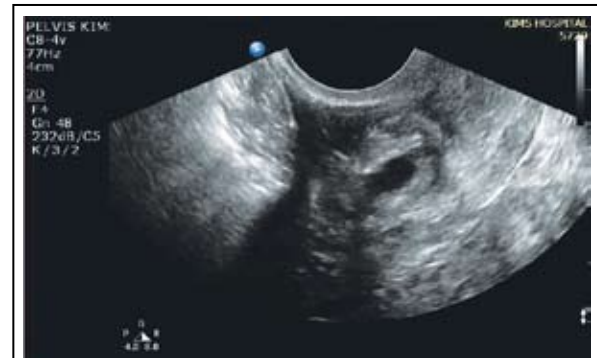
Figure 1: A hypochoic lesion of size 1.7 x 1.0 cm detected in the LUS region of uterus, postero inferior to scar site, which represented a blood vessel dilated.

time normal. ESR, RFT, LFT and D-DIMER are within normal limits. 1 unit of fresh compatible packed cells blood transfusion was given & broad spectrum antibiotics were started. 2) TVS with color doppler was done and confirmed: a) a postpartum uterus; b) no e/o residual placental tissue in endometrial cavity & endometrial thickness was 8 mm; c) A hypochoic lesion of size 1.7 x 1.0 cm detected in the Lower uterine segment of uterus, postero inferior to the site of scar (Figure 1).